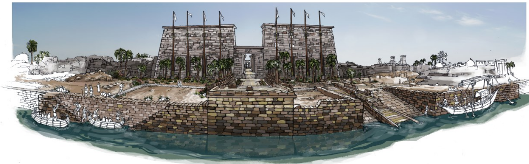
Figure 2: Artistic impression of the main quay of Karnak

Among the discoveries from late Roman times is a Roman bath (Figure 4) that was found north of the Ptolemaic bath discovered in 2007. The Roman bath covers 3,000 m 2 , with many archaeological features having been discovered. Many blocks from the Pharaonic Period were discovered reused in the construction of this bath. Among the finds was the false door of Useramun, vizier during the reign of