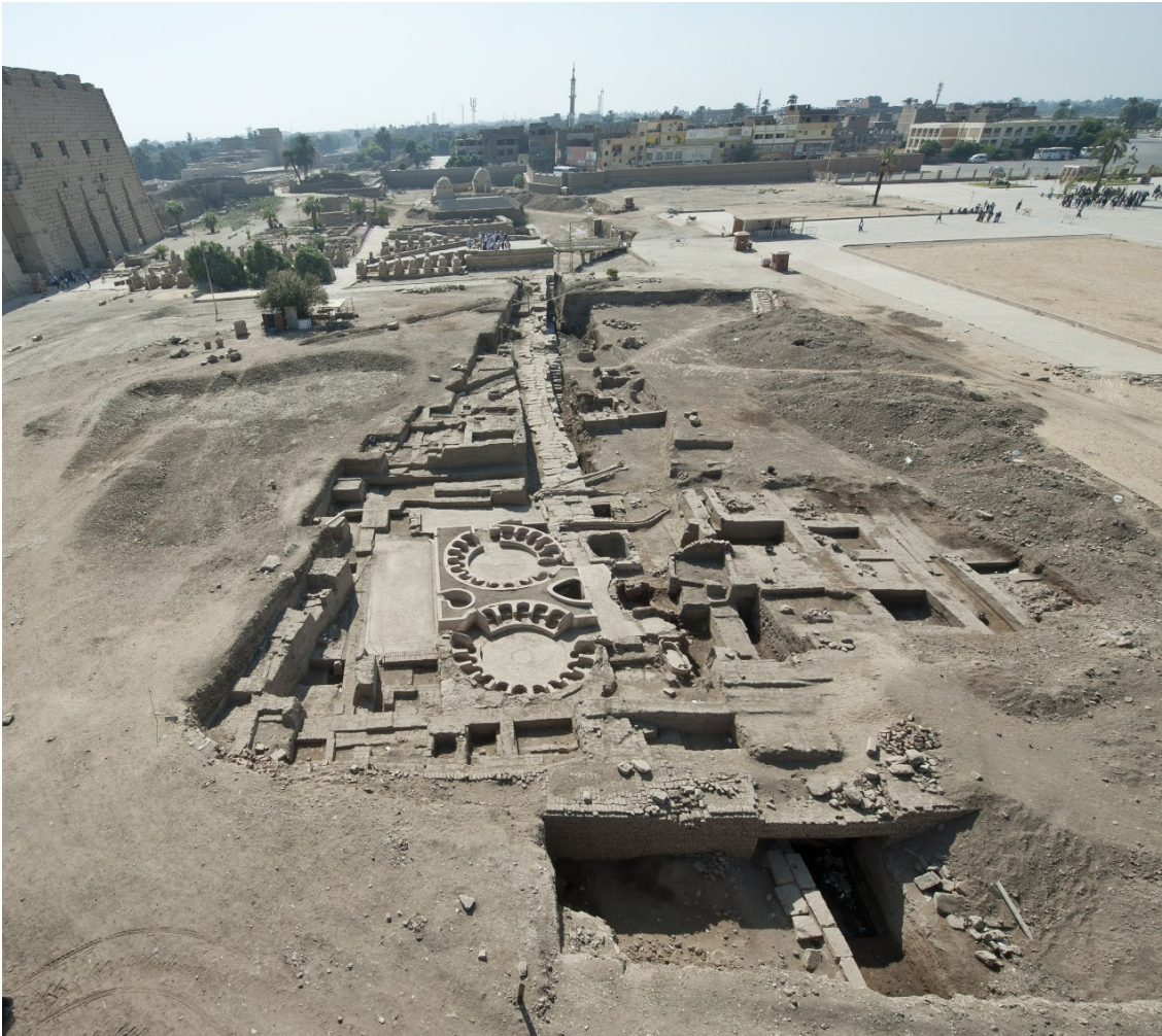
Figure 8: The Ptolemaic bath with embankment

The third register depicts the following (from right to left): two trees, from the second of which the goddess Nut appears, holding in her right hand a hes vase with purification water flowing toward four women. The first three women are represented kneeling, and the fourth at the end is standing. The lower part of this register is missing. The text above this scene is also damaged but has been deciphered as the following: