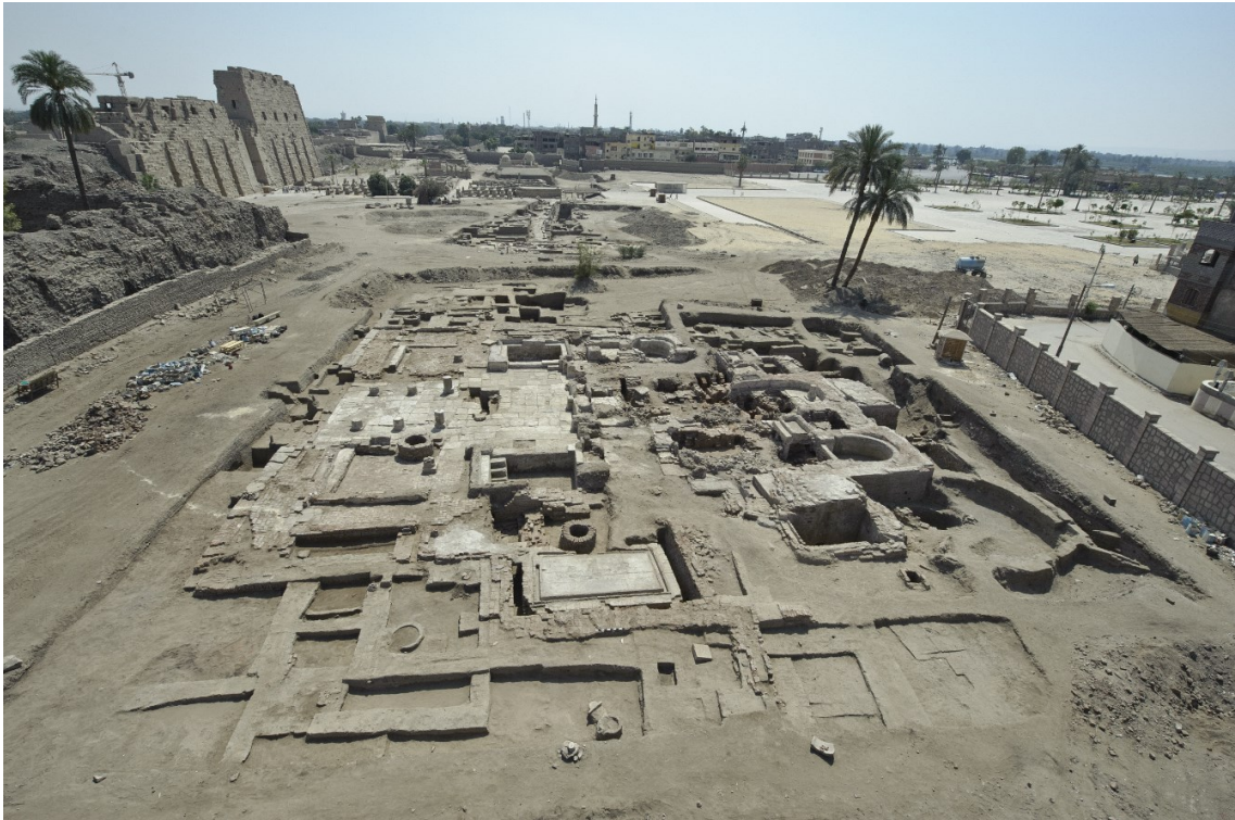
Figure 4: The area of the Roman bath