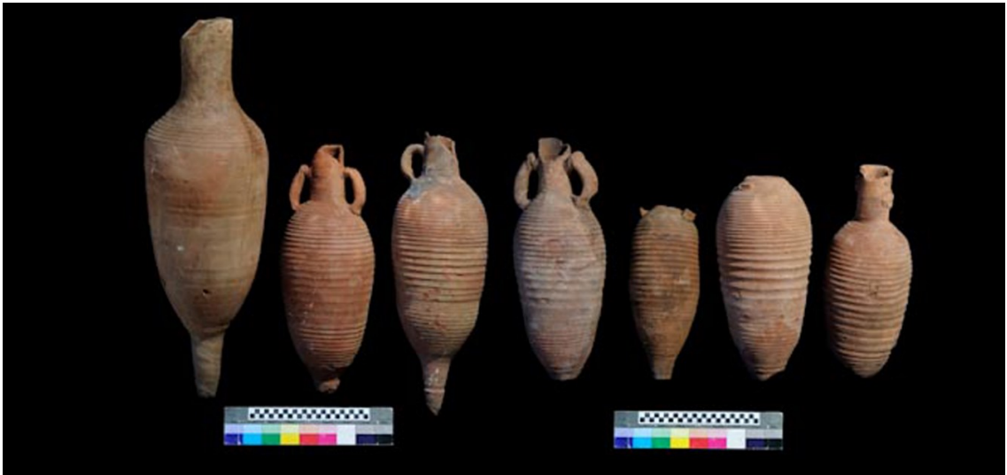
Figure 5: Amphoras found in the area of the Roman bath