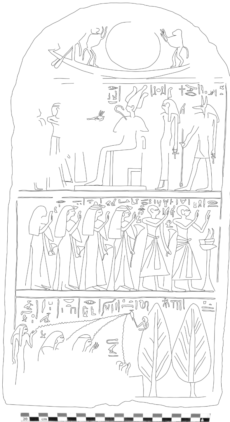
Figure 10: Epigraphic drawing of the Ramesside stela