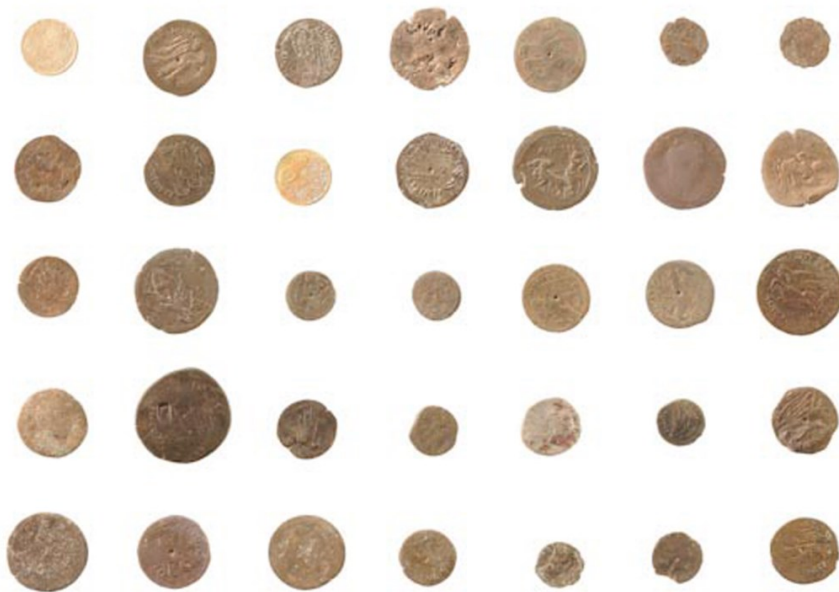
Figure 7: Roman Period coins

The second register has a scene of six figures facing right, in an adoring position. The figures are two men and four women who most likely represent the family of the deceased. In front of the figures is a stand holding incense. The first man on the right raises his hands in adoration. He has a shaved head and is wearing a long kilt. He is followed by a second man, wearing the same kind of kilt. This man raises his right hand in adoration and holds a lotus flower in his left hand. The four women behind them wear long garments that cover their shoulders. They raise their right hands in adoration and hold lotus flowers in their left ones. The second woman wears a perfume cone on her head. The figures are mentioned by their names. Most likely they are offering in the presence of the deceased. The text above the figures is hard to read because it is just scratched into the stone and is preserved in a bad condition.