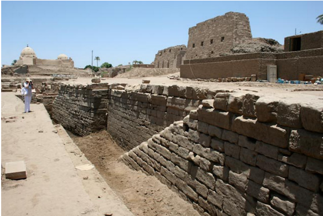
Figure 3: The embankment found in front of Karnak

The stela is of white limestone, with the following measurements: height, 51 cm; width, 27 cm; thickness, 10 cm. It is rectangular in shape and was prepared