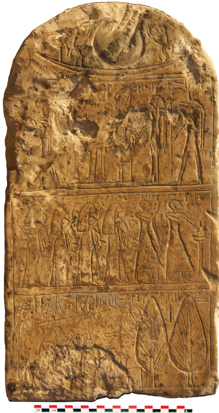
Figure 9: Photograph of the Ramesside stela