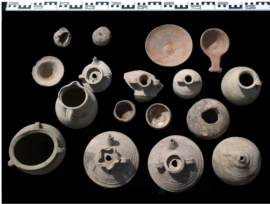
Figure 6: Pottery from the third century CE

with incised borderlines at both sides and has a rounded top. The stela was cut from a reused block, as it has the remains of a sunk relief on its thickness showing part of two legs of a man wearing a short kilt. The stela itself was carved in three registers divided by two incised lines. The rounded upper part (lunette) is decorated in low sunk relief and depicts the sun god's boat with two oars at the stern. The scene also has two baboons praising the sun disk. According to Egyptian myth, the sun god in his barque knows his way through the darkness of night to his own rebirth in the morning, having done so since the beginning of time. This depiction represents the first hour of the Amduat. 4